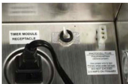
Unplug the jumper connection from the transformer