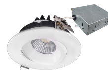
SLIM4DGR-5CCT WH (white)