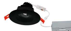
SLIM-RG3-5CCT BK (black)