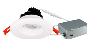
SLIM-RG3-5CCT WH (white)