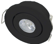
Black (PUK M2G BK)