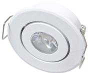
White (PUK M2G WH)