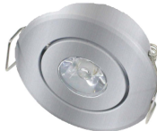
Satin Nickel (PUK M2G SN)