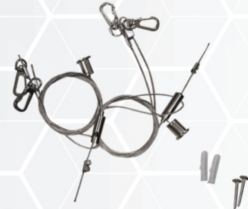
PANEL-SUS-KIT Length of steel cable: 1m (3.3 ft.)