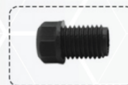
2. Small cap to connect wires from the Lights