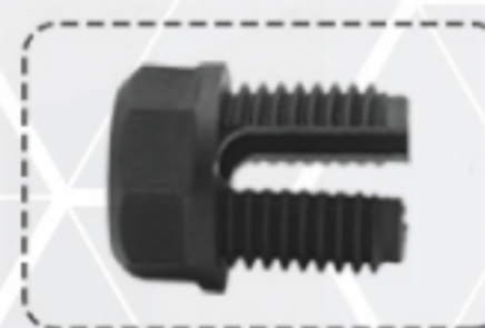
3. Cap to connect Power Cable