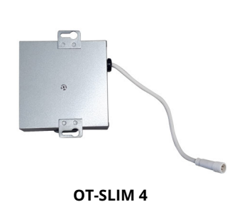
Mounting Plate for ORTECH 4" Slim Lights