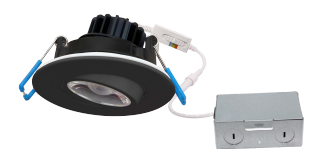
SLIM3GIM-5CCT BK (black)