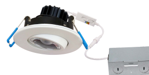
SLIM3GIM-5CCT WH (white)